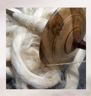
SPINNING From here, weaving etc. on conventional equipment.