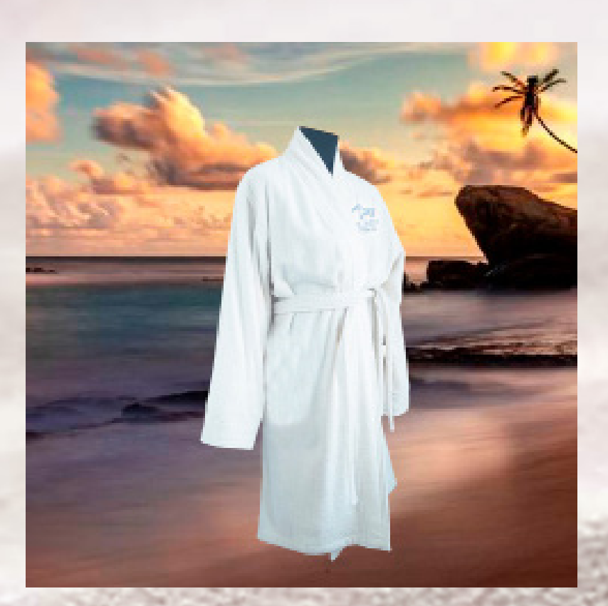
Bathrobe, Natural White