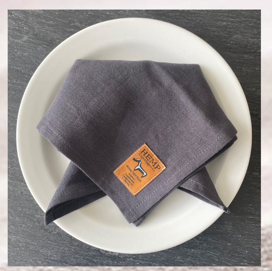
Napkin Charcoal Grey.