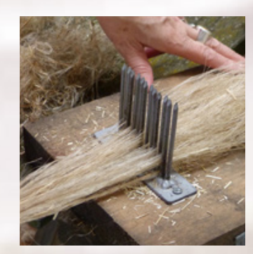
COMBING Removing pectin and other impuriites manually.