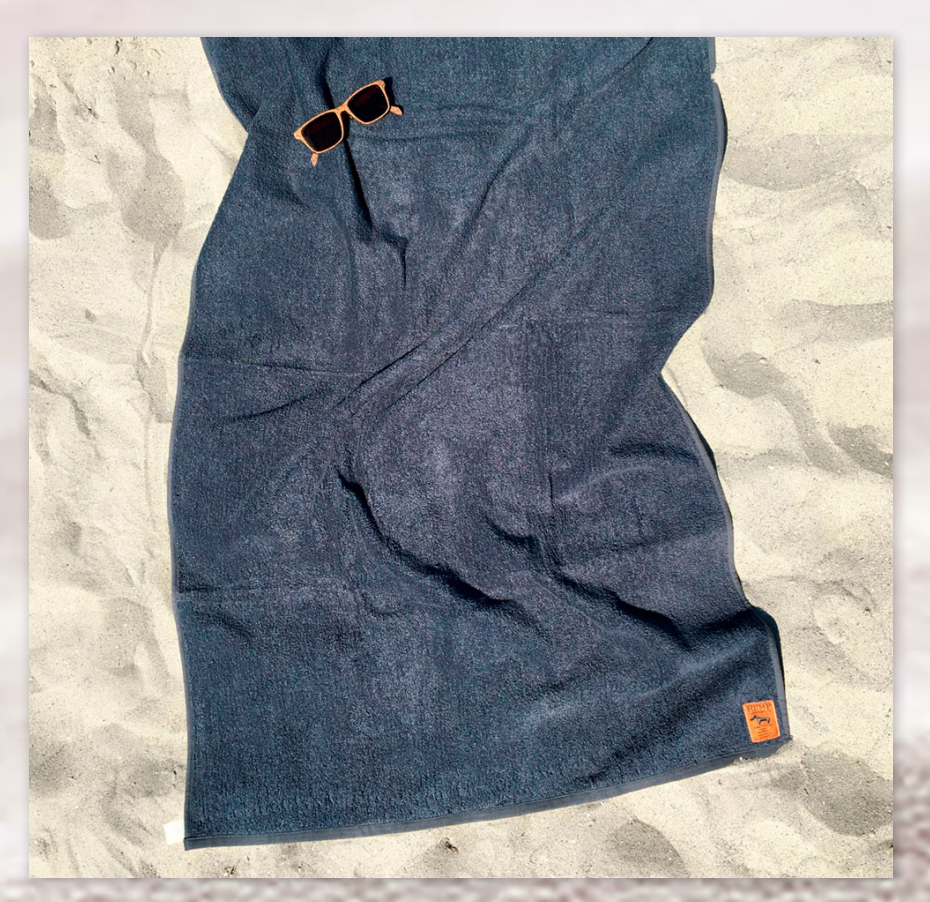
Beach Towel, Charcoal Grey.

We can make beach towels in a range of nice colours: e.g. our popular Charcoal Grey, Black, or Natural White or any colour you wish. – Any dye used is GOTS-certified.