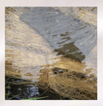
RETTING Stalks are soaked in water 4-6 weeks, manully attended.