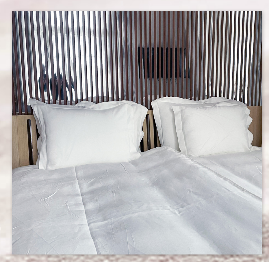
Villa Copenhagen, Denmark, Earth Suite: Hemp Copenhagen bed linen, Scandinavian style,

Our bed linens are made of plain weave (or satin weave) 100% European Hemp, ca. 180 GSM.